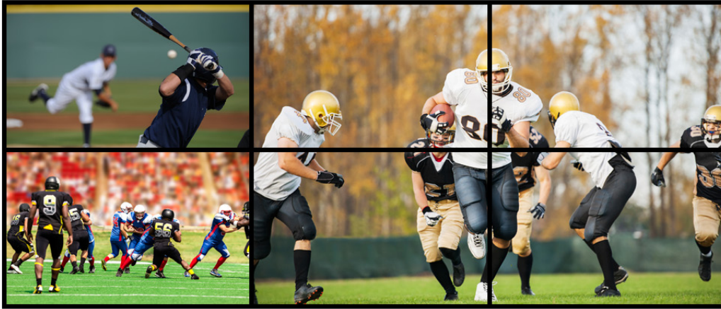
3x2 Video Wall