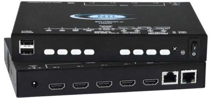
SPLITMUX-4K-4RT (Front & Back)