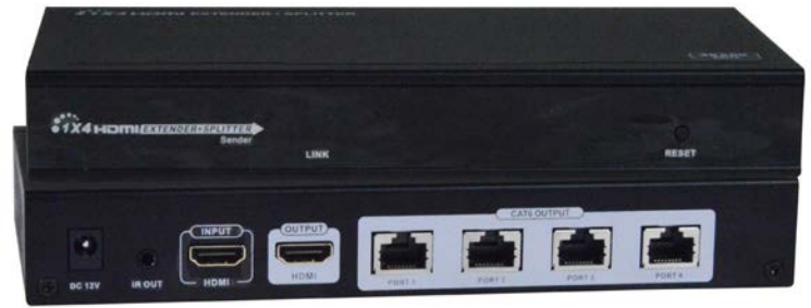
VOPEX-C64K18GB-4 Local Unit (Front & Back)

The VOPEX® 4K HDMI Splitter/Extender simultaneously distributes uncompressed Ultra-HD 4Kx2K 60Hz 4:4:4 HDMI video, multi-channel audio, and IR from one video source to up to four displays and speakers, each located up to 100 feet away via CATx cable.