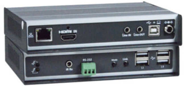
XTENDEX® ST-IPUSB4K-VW (Local & Remote Unit)