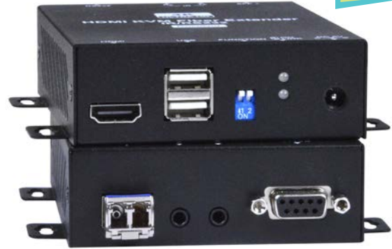
ST-FOUSB4K18GB-LC (Remote and Local Units)