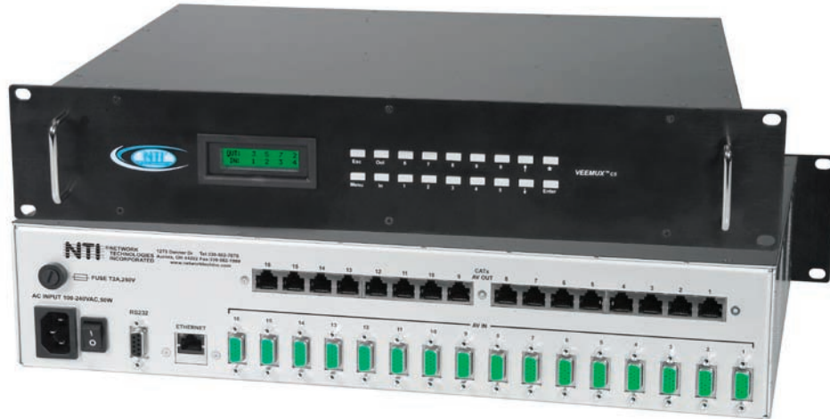
VEEMUX® SM-16X16-C5AVR-LCD (Front & Back)