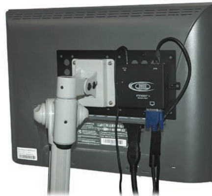
Remote unit mounted to the back of a flat panel monitor using ST-C5MK-VESA mounting kit