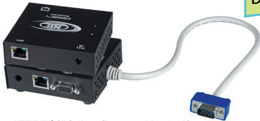
XTENDEX® ST-C5V-600 (Remote and Local unit)