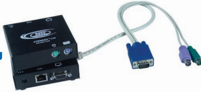
XTENDEX® ST-C5KVM-600 (Remote and Local Units)