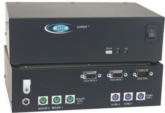
VOPEX-2KVIM-A (Front & Back)

The VOPEX® VGA PS/2 KVM splitter allows up to four users to share the use of one PS/2 computer.