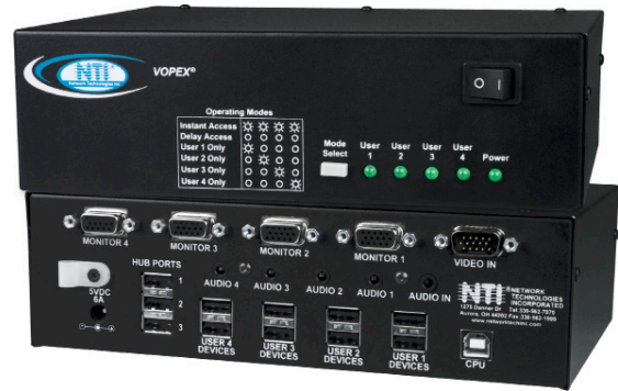
VOPEX-USBVA-4 (Front & Back)

The VOPEX® VGA USB KVM Splitter with built-in USB hub allows up to four users (four USB keyboards, mice and VGA monitors) to access one USB computer (PC, SUN, MAC) and up to three USB devices (printers, scanners, security cameras, etc).