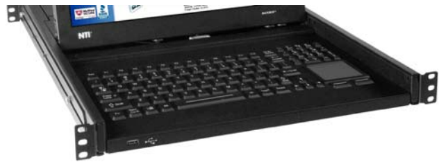
VGA USB + PS/2 KVM Drawer with Liquid-proof Keyboard