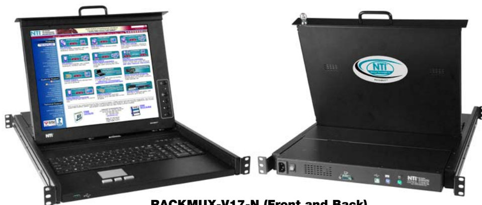
RACKMUX-V17-N (Front and Back)