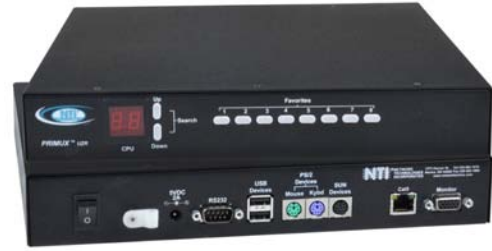
PRIMUM-UZR (Front & Back)