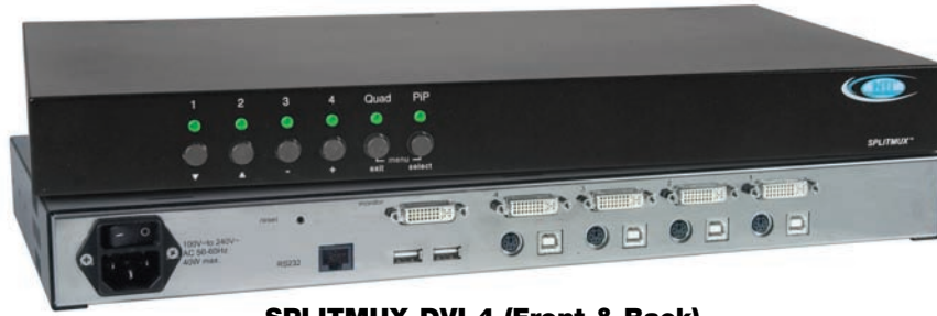
SPLITMUX-DVI-4 (Front & Back)

Display video from four computers simultaneously on a single LCD/plasma monitor