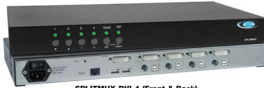
SPLITMUX-DVI-4 (Front & Back)

Display video from four computers simultaneously on a single LCD/plasma monitor