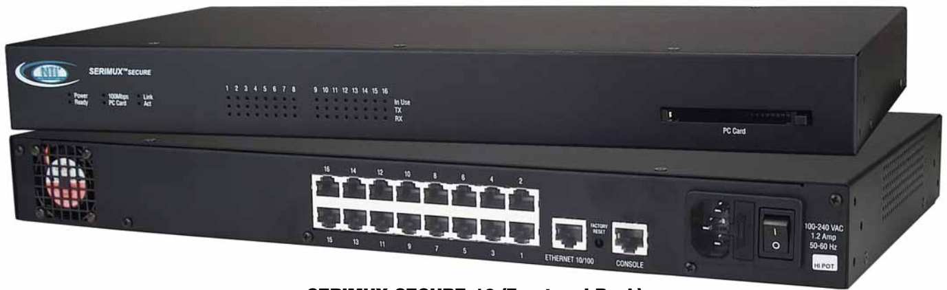
SERIMUX-SECURE-16 (Front and Back)

Securely control up to 32 RS232 devices via the Internet