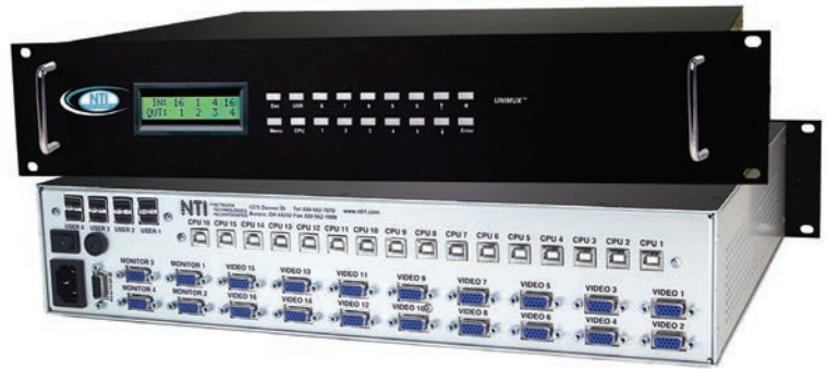
UNIMUX-4X16-U (Front and Back)

The UNIMUX™ VGA USB KVM Matrix Switch allows multiple users to individually command or simultaneously share many USB computers. Access USB-enabled PC, SUN, and MAC computers using USB keyboards and mice, and VGA multiscan monitors.