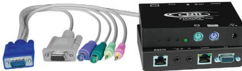
XTENDEX® ST-C5KVM2ARS-1000S (Remote and Local Units)