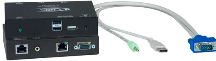
XTENDEX® ST-C5USBVUA-1000S Local and Remote Units