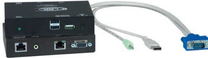
XTENDEX® ST-C5USBVUA-1000S Local and Remote Units