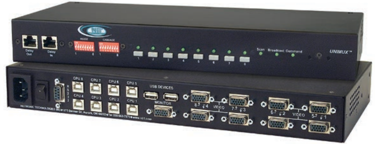
UNIMUX-USBV-8ORS (Front & Back)