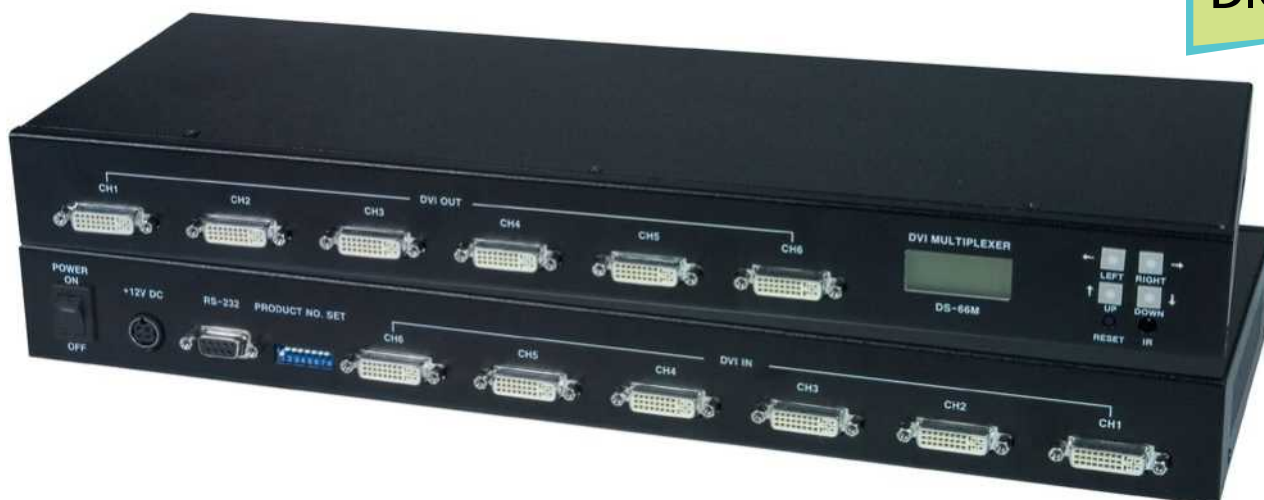
VEEMUX® SM-6X6-DVI (Front and Back)