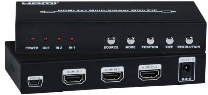
SPLITMUX-HD-2LC (Front & Back)