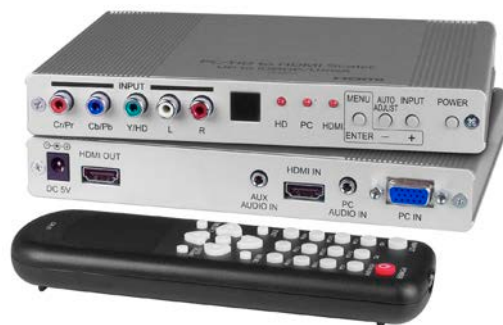
PCHD-HDMI-SCALER (Front & Back + Remote)

The VGA/Component Video/HDMI Scaler/Converter upscales HDMI, VGA or component video signals up to 1920x1200 video resolution (WUXGA). It also converts component video or VGA, with audio, to a single HDMI stream with integrated audio.