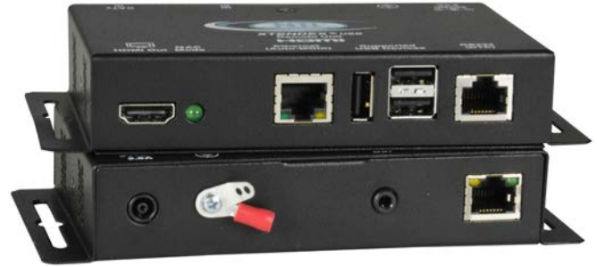
XTENDEX® ST-C6USBHE-HDBT (Remote and Local Unit)