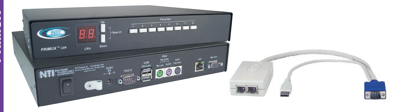
PRIMUX-UZR (Front and Back) and HA-USB Host Adapter