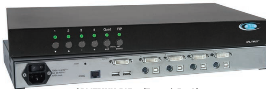
SPLITMUX-DVI-4 (Front & Back)

Display video from four computers simultaneously on a single LCD/plasma monitor