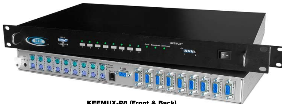
KEEMUX-P8 (Front & Back)

Control multiple PCs with one keyboard, monitor and mouse