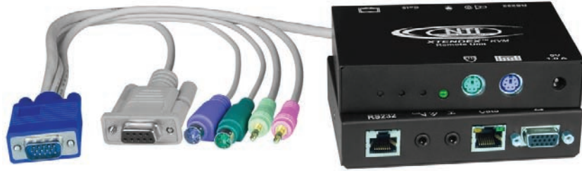
XTENDEX® ST-C5KVM2ARS-1000S (Remote and Local Units)