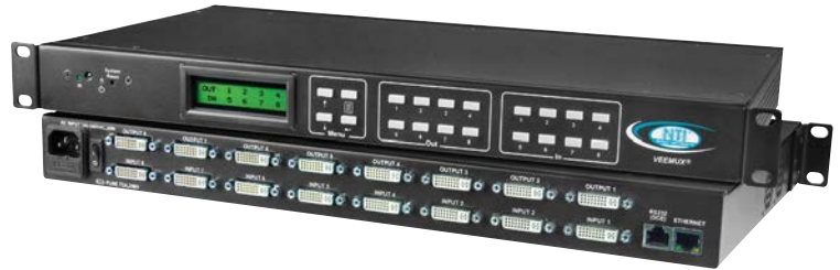
VEEMUX® SM-8X8-DVI-LCD (Front & Back)