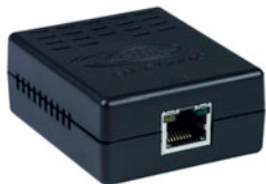
ENVIROMUX-STTS ENVIROMUX-STHSB ENVIROMUX-STHS-99