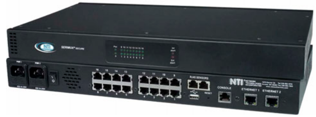
SERIMUX-S-16DP (Front & Back)