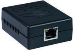
ENVIROMUX-STX ENVIROMUX-SHS ENVIROMUX-STHS