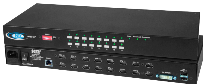
UNIMUX-DVI-16HD (Front & Back)

The UNIMUX™ High Density DVI USB KVM switch allows you to control up to 32 single link DVI or HDMI USB computers with one DVI-D monitor, USB keyboard and USB mouse.