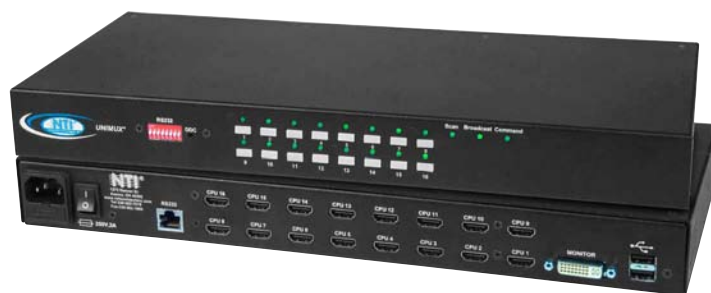
UNIMUX-DVI-16HD (Front & Back)

The UNIMUX™ High Density DVI USB KVM switch allows you to control up to 32 single link DVI USB computers with one DVI-D monitor, USB keyboard and USB mouse.