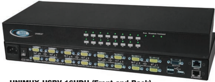
UNIMUX-USBV-16HDU (Front and Back)

Control up to 32 USB computers with one USB keyboard, USB mouse & VGA monitor