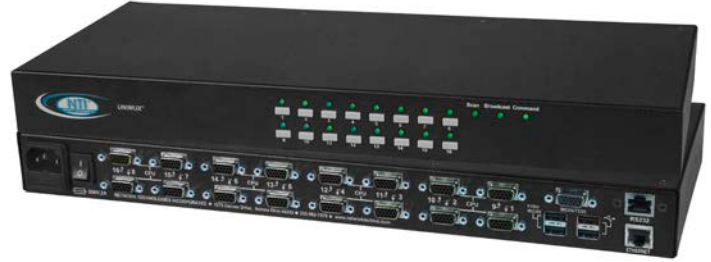
UNIMUX-USBV-16HDUT (Front & Back)