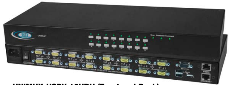
UNIMUX-USBV-16HDU (Front and Back)