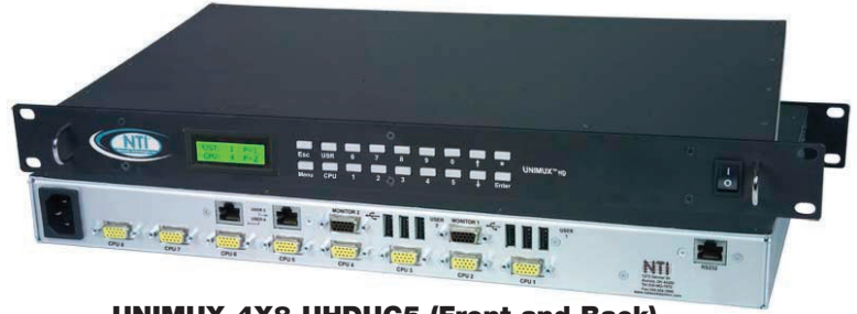
UNIMUX-4X8-UHDUC5 (Front and Back)