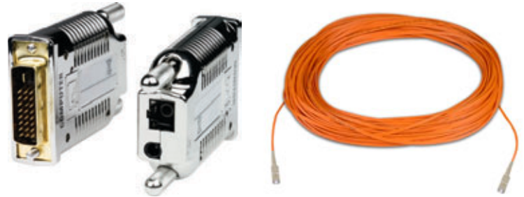
ST-1FODVI-SC Receiver and Transmitter