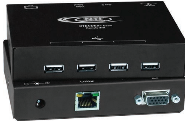
ST-C5USBVT (Remote Unit, Front and Back)