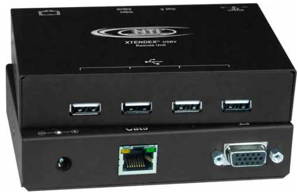
ST-C5USBVT (Remote Unit, Front and Back)

The Transparent VGA USB Extender extends four USB devices and a VGA monitor up to 200 feet (61 meters). Each USB extender consists of a local unit that connects to a computer and also supplies video to a local monitor, and a remote unit that connects to four USB devices and a monitor.