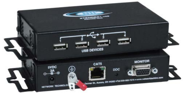
ST-C5USBVT (Remote Unit, Front and Back)

The XTENDEX® Transparent VGA USB Extender extends four USB devices and a VGA monitor up to 200 feet. Each USB extender consists of a local unit that connects to a computer and also supplies video to a local monitor, and a remote unit that connects to four USB devices and a monitor.