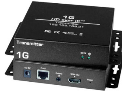
XTENDEX® ST-IPHDMI-R-333 (Front and Back)

The XTENDEX® HDMI Over IP Extender multicasts digital video and audio signals to one or more receivers up to 333 feet (100 m) away using CAT5e/6/7 cable.