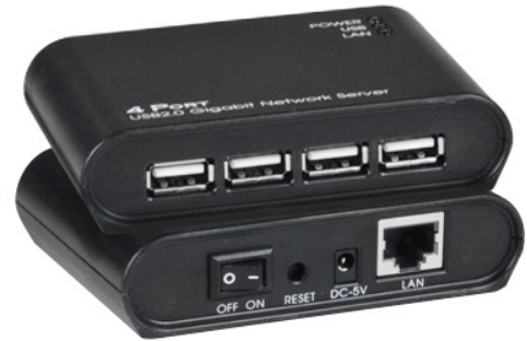
USB-IP-4LC (Front & Back)