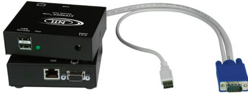
XTENDEX® ST-C5USBV-300 (Remote and Local Units)