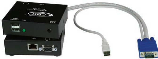
XTENDEX® ST-C5USBV-300 (Remote and Local Units)

Extend USB keyboard, USB mouse and VGA monitor up to 300 feet