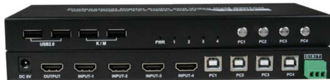
UNIMUX-HD4K18GB-4LC (Front & Back)