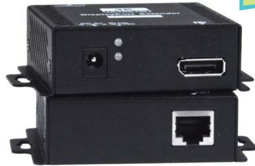
XTENDEX® ST-C6DP4K-131 (Remote & Local Unit)