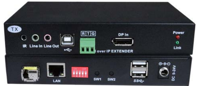
ST-C6FOUSBBDP4K-LC (Local and Remote Units)