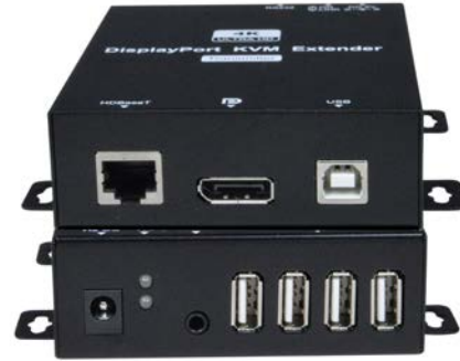
ST-C6USBDP4K-328 (Local & Remote Unit)