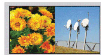
Dual Screen with Custom Mode (2K, 1080p, 1920x1200)