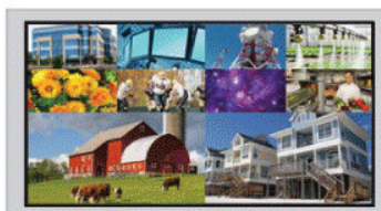
Cascaded (4K, 2K, 1080p, 1920x1200)