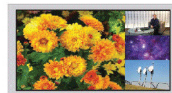
PIP Mode (2K, 1080p, 1920x1200)