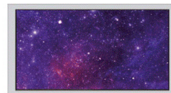
Full Screen Mode (4K, 2K, 1080p, 1920x1200)