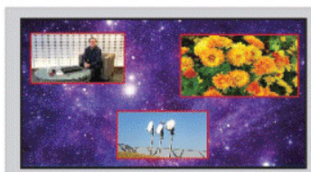
Custom Mode with Individually Configured Windows and Enabled Borders (2K, 1080p, 1920x1200)