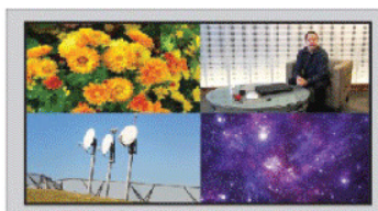
Quad Mode (4K, 2K, 1080p, 1920x1200)