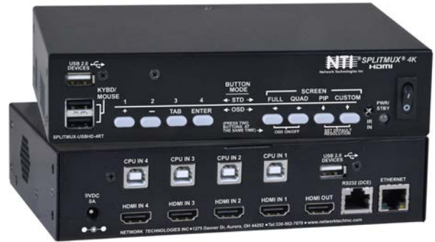
SPLITMUX-USB4K-4RT (Front & Back)