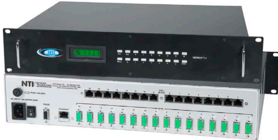
VEEMUX® SM-16X16-C5AVR-LCD (Front & Back)