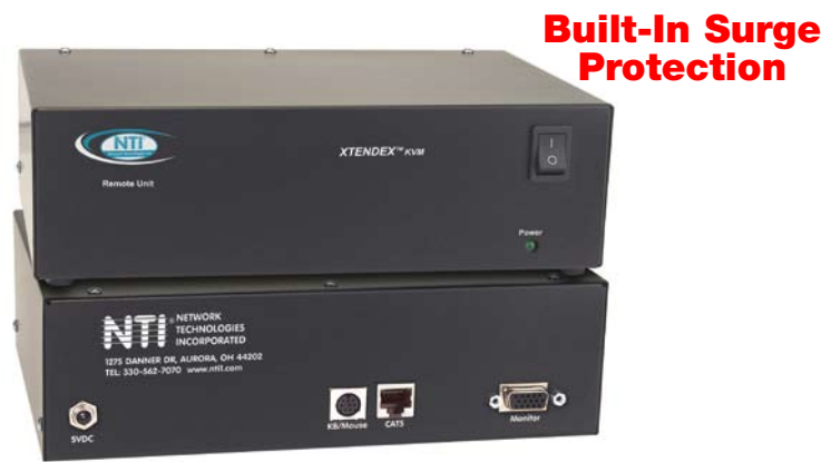
XTENDEX® ST-C5KVM Remote Unit (Front and Back)

Extend control up to 1,000 feet away from a PC, SUN or NTI KVM Switch