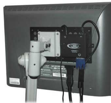
Remote unit mounted to the back of a flat panel monitor using ST-C5MK-VESA mounting kit