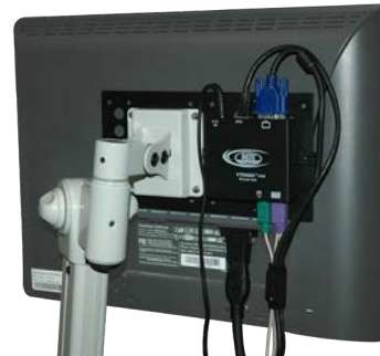
ST-C5MK-VESA - VESA Mounting Bracket