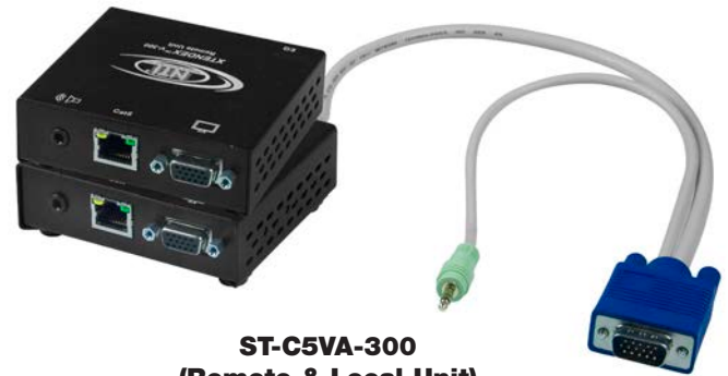
ST-C5VA-300 (Remote & Local Unit)