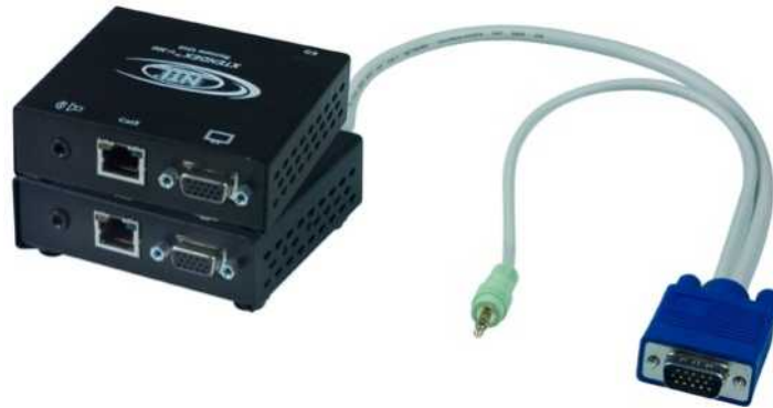
XTENDEX® ST-C5VA-300 (Remote and Local unit)