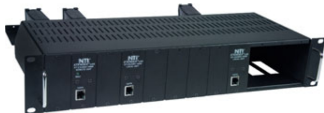
XTENDEX® ST-C6RCK-12A with ST-C5USBVA-300M Extender Modules (Front)