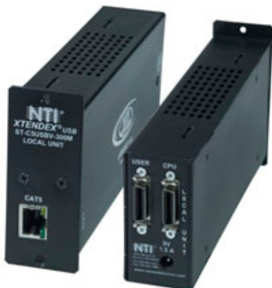
ST-C5USBV-L-300M (Front & Back)