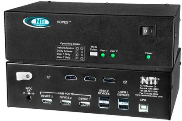
VOPEX-USBH-2 (Front & Back)

The VOPEX® HDMI/DVI USB KVM splitter with built-in USB hub allows up to four users (four USB keyboards, USB mice and DVI/HDMI monitors) to access one USB computer and up to three USB devices (printers, scanners, security cameras, etc.).