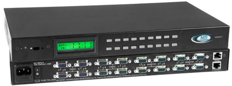
VEEMUX® SM-8X8-15V-LC (Front and Back)

The VEEMUX switch is the ideal solution for any application where information from many computers is being presented, such as: