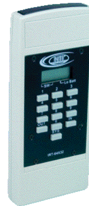
IRT-64X32 Infrared Remote Control (For 16- and 32-Input SM-nXm-15V-LCD Models & All SM-nXm-AV-LCD Models)