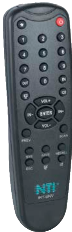
IRT-UNV Infrared Control Option (For 4- and 8-Input SM-nXm-15V-LC Models)