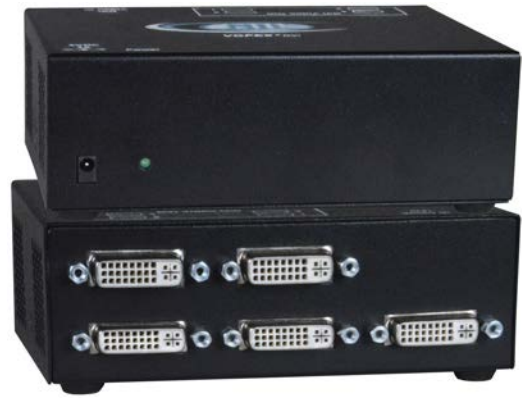
VOPEX-DVIS-4 (Front and Back)

The VOPEX® DVI Video Splitter enables up to four single link digital DVI displays to be driven by a single digital DVI source with no loss of signal.