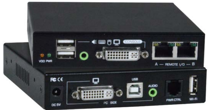
INTERMUX-KVMDUAIP-CLR (Front & Back)

The INTERMUX™ DVI USB KVM on IP™ device is used to control one or many computers locally at the server site or remotely via the Internet using a standard browser. Securely gain BIOS level access to systems for maintenance, support, or failure recovery over the Internet. Communication is secure and can be used in conjunction with a KVM switch for multiple-server access.